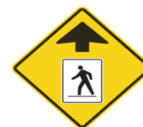
Pedestrian Crossover Ahead signs are 20m to 100m from the crossing.

If you see any of these signs, you are approaching a pedestrian crossover. Watch for them.