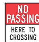
No Passing signs are located 30m from the crossover.