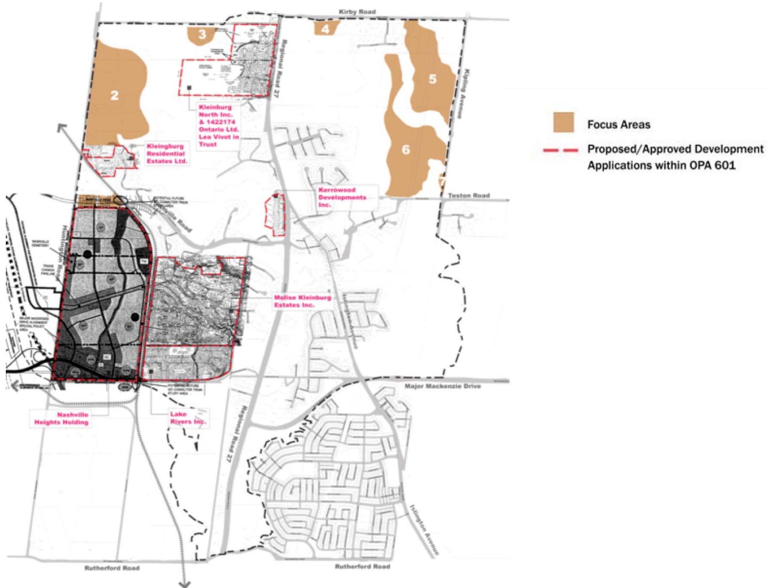
Kleinburg & Nashville | proposed/approved development plans